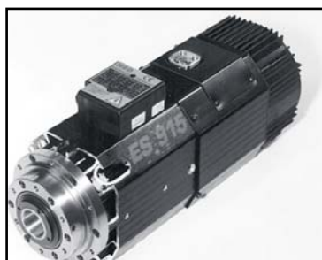
5 Hp ISO30 Tool Change