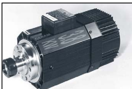
5 Hp HSD ER32 Colleted Router

**Does not include Travel/Lodging or Meals of Installation/Training Personnel.